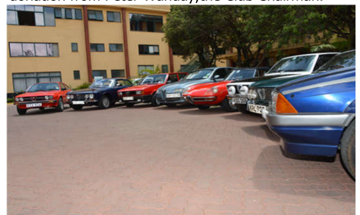
ALFA CAR PARK. The Kenya Red Cross car park was full of Alfa Romeo cars at the end of the Charity Trail.