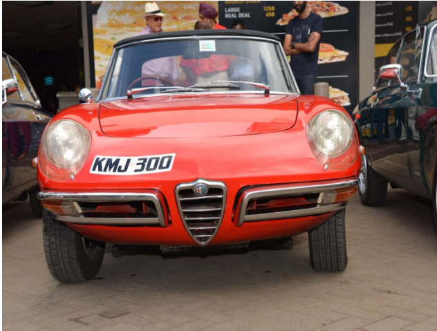
STAR CAR. The 1968 Alfa Romeo 1750 Spider was the star car in the Charity Trail.