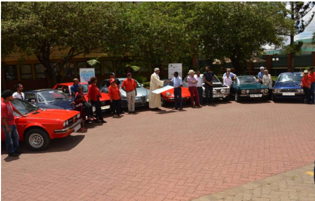
135,000 SHILLINGS. Club members gather with their cars in the grounds of the Kenya Red Cross for the donation of 135,000 shilling for famine relief.