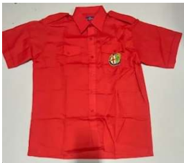
Mens Pilot Shirts (available in Red)