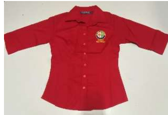
Ladies Blouses (available in Red)