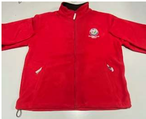
Fleece Jackets (available in Red and Blue)

The club has on sale the following exciting branded merchandise. These will be on sale at all club events or you may contact the club secretary.