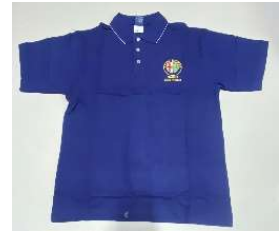
Unisex Polo Shirts (available in Blue)