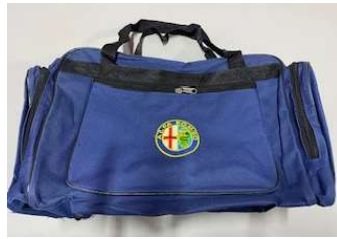
Sports Bag (available in Blue)