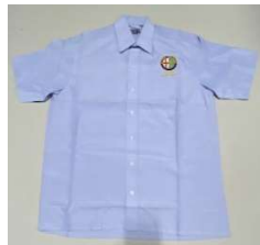
Men's Short Sleeved Shirts (available in Light Blue, Purple and White)