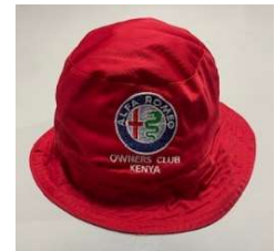
Bucket Hats (available in Red)