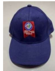
Polo Caps (available in Blue)