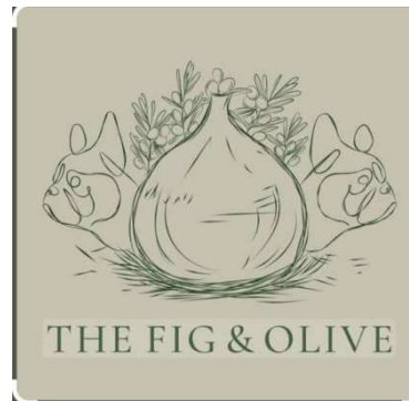
FIG & OLIVE RESTAURANT

Gather from 10:00 a.m. on Sunday 21 st July at ABC TotalEnergies Service Station on Waiyaki Way for socialising and briefing for an Alfa Romeo Owners Club convoy to Fig & Olive.